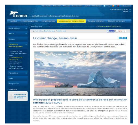
Page web de l'exposition sur le site de l'Ifremer

On the Ifremer website, complementary information are offered : educational support for teachers, information sheets for general public awareness and scientific sheets for readers comfortable about science.