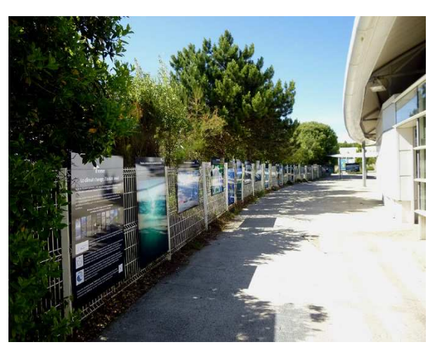
Présentation de l'exposition à Océanopolis, Brest, du 5 juin au 31 août.

Climate change also strongly impacts the oceans, species living there, as well as coastlines that are subject to an important increase of risks.